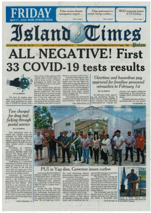
Island Times April 17 2020